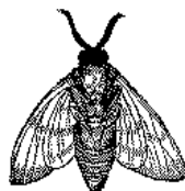
Figure 2: A sample black and white graphic that has been resized with the includegraphics command.